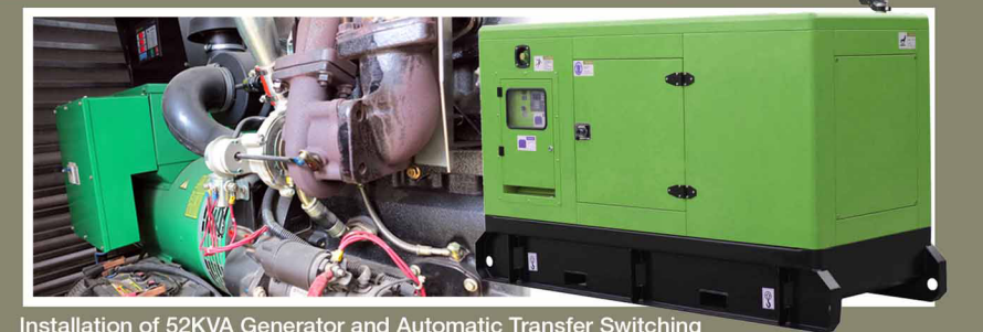
Installation of 52KVA Generator and Automatic Transfer Switching for residence at Macopa Street, Angeles City.