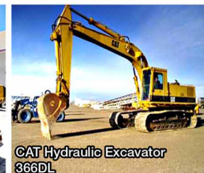
CAT Hydraulic Excavator 366DL