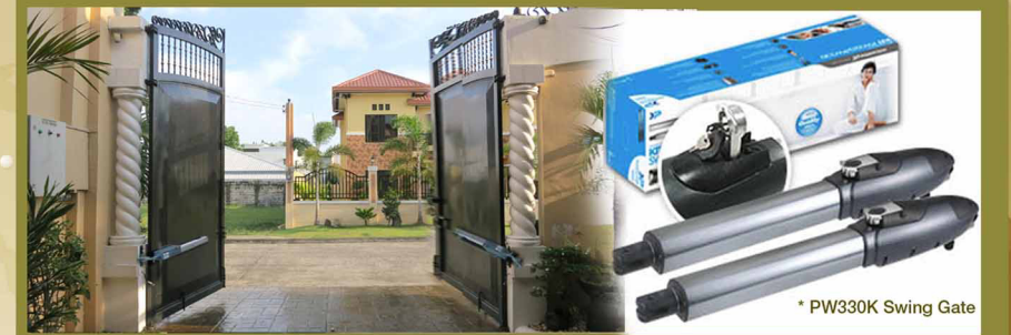
* PW330K Swing Gate