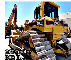
CAT Tractor D6R III