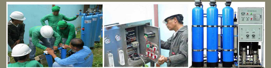
Installation of Water Filtration Unit that can provide 290 gallons of drinking water a day at Brgy. Slnag Tala Orani Bataan.