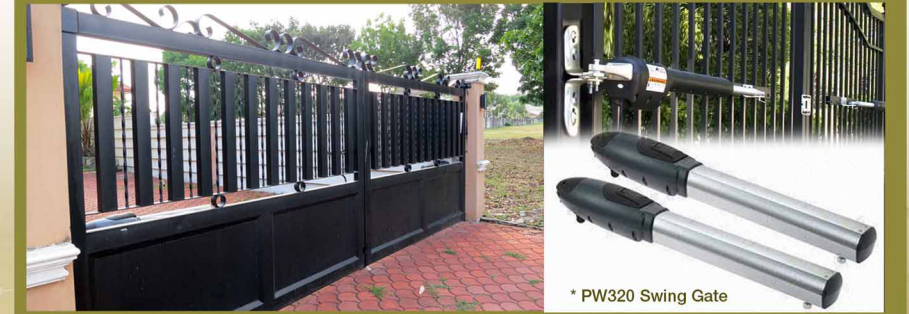
* PW320 Swing Gate

Home Repair and Maintenance at Hensonville and Sunset Plaza II: Repair and maintenance of residential homes to include installation of two sets of new automatic gate sets.