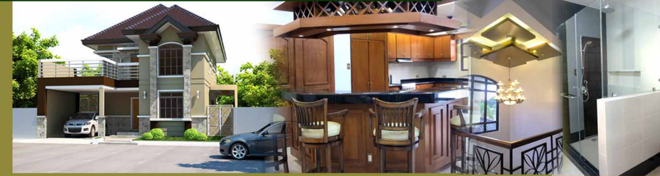
Design, engineering and construction of new 240 square meter home at Pulu Amsic Angeles City