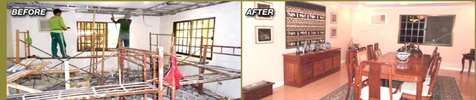
Renovation of residence at Sangley Loop, Olongapo to include rooms, removal of old walls and construction of new, installation of new appliances, repainting interior and exterior etc.