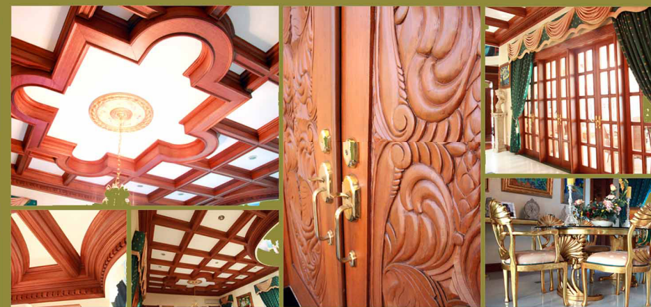
Renovation of residence at Macopa Street Angeles to include room renovations, removal of old walls and construction of new, installation of new appliances, repainting interior and exterior etc.