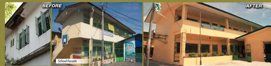
Renovation of Magsaysay Elem School Dau Mabalacat Pampanga.