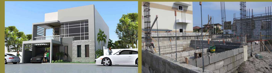
Design, engineering and construction of new 350 square meter home Pulu Amsic Angeles City