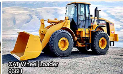
CAT Wheel Loader 966H